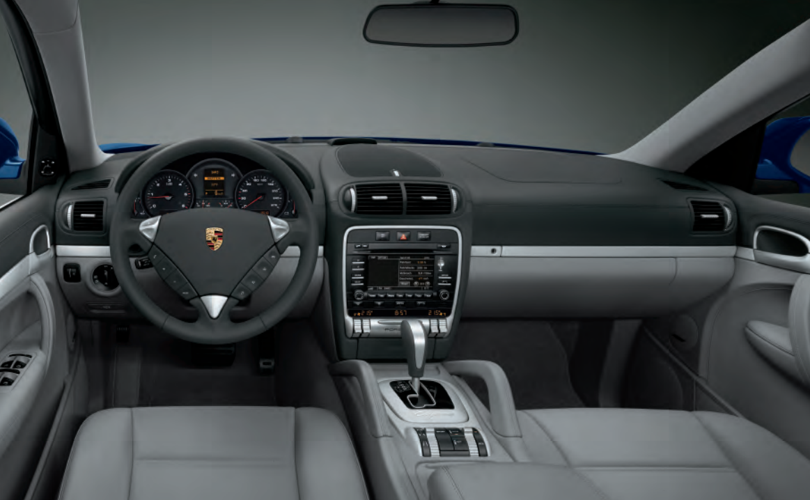
Cockpit of the new Cayenne Diesel with Sport aluminium package