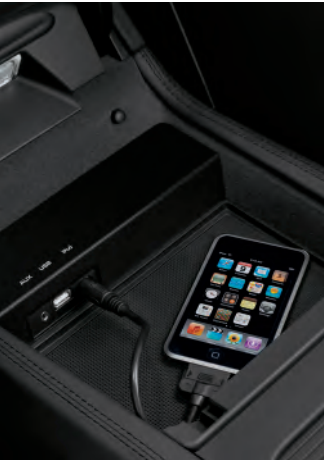
Universal audio interface (iPod®, USB, AUX)

◦ extra-cost option • standard equipment W no-cost option