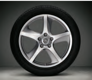
20-inch Cayenne SportTechno wheel