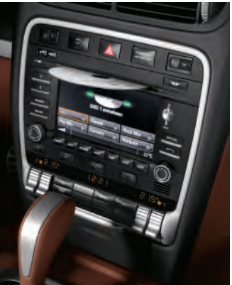
Porsche Communication Management (PCM) with CD/DVD autochanger (6-disc)