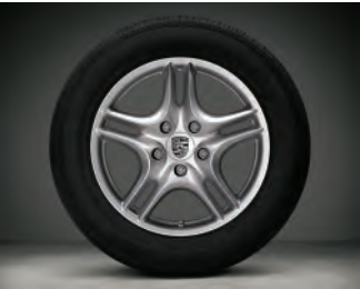
18-inch Cayenne Turbo II wheel