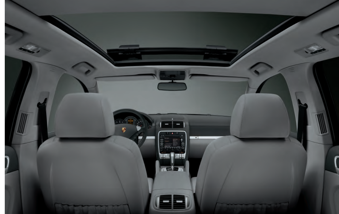
Panoramic roof system

The standard specification includes the CDR-30 CD radio with twin-tuner and 12 speakers. The optional Porsche Communication Management (PCM) is an intuitive central control system for audio, navigation