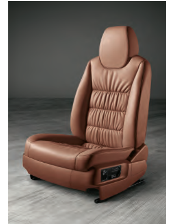
Soft ruffled leather seat

◦ extra-cost option • standard equipment W no-cost option Please refer to page 23 for footnotes.