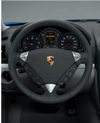
3-spoke multifunction steering wheel with Tiptronic S gearshift controls