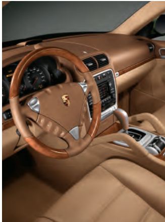
Light olive package with high-gloss finish