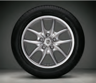
19-inch Cayenne Design wheel