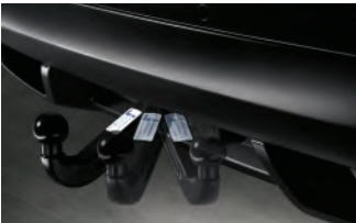
Electrically deployable/retractable towball