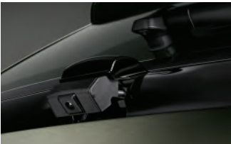
Reversing camera (deployed)