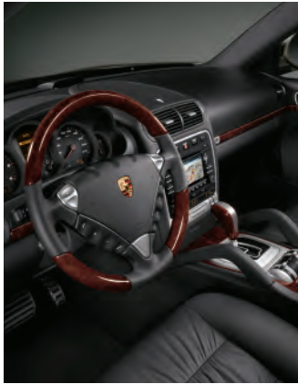
Dark walnut package with high-gloss finish