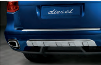
Stainless steel skid plate (rear)

For information on all other options for the new Cayenne Diesel, please consult the Cayenne Diesel price list, the Cayenne catalogue or your nearest Porsche Centre. To find out about our range of accessories and factory-fitted options, please refer to the Exclusive Cayenne catalogue and Tequipment Cayenne catalogue.