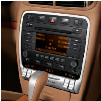
CDR-30 CD radio