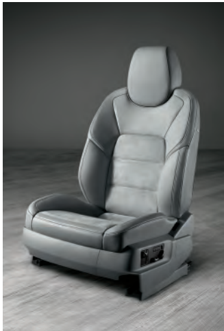
Sports seat with comfort memory package