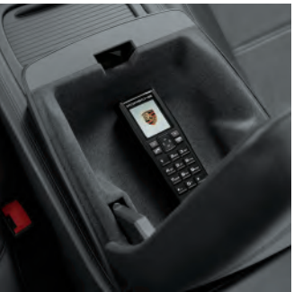
Telephone module with cordless keypad handset