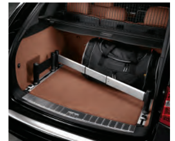
Loadspace management system