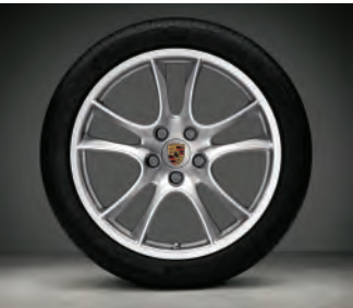
21-inch Cayenne Sport wheel