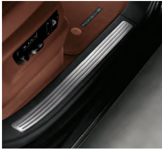
Comfort memory package with outer door-sill guards in stainless steel