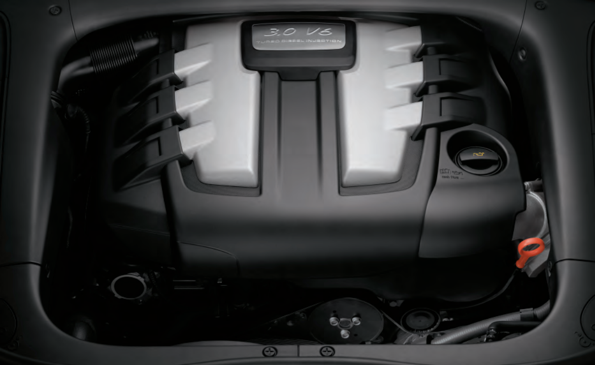
The 3.0-litre V6 turbo-diesel