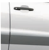
Natural White 1,2 with Gray or Taupe interior