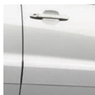
Frosted White Pearl 3 with Gray or Taupe 2 interior