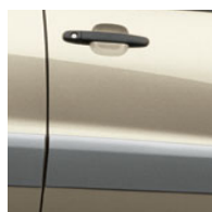
Vintage Gold Metallic 1,2 with Taupe 4 interior