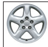
Available 5-spoke aluminum alloy wheel 2