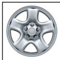
Standard 5-spoke styled steel wheel