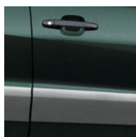
Rainforest Pearl with Gray or Taupe 2 interior