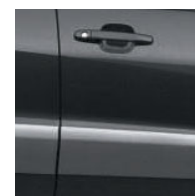
Graphite Gray Pearl 5 with Gray 4 interior