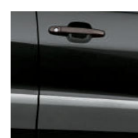
Black with Gray or Taupe 2 interior