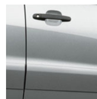
Titanium Metallic with Gray interior