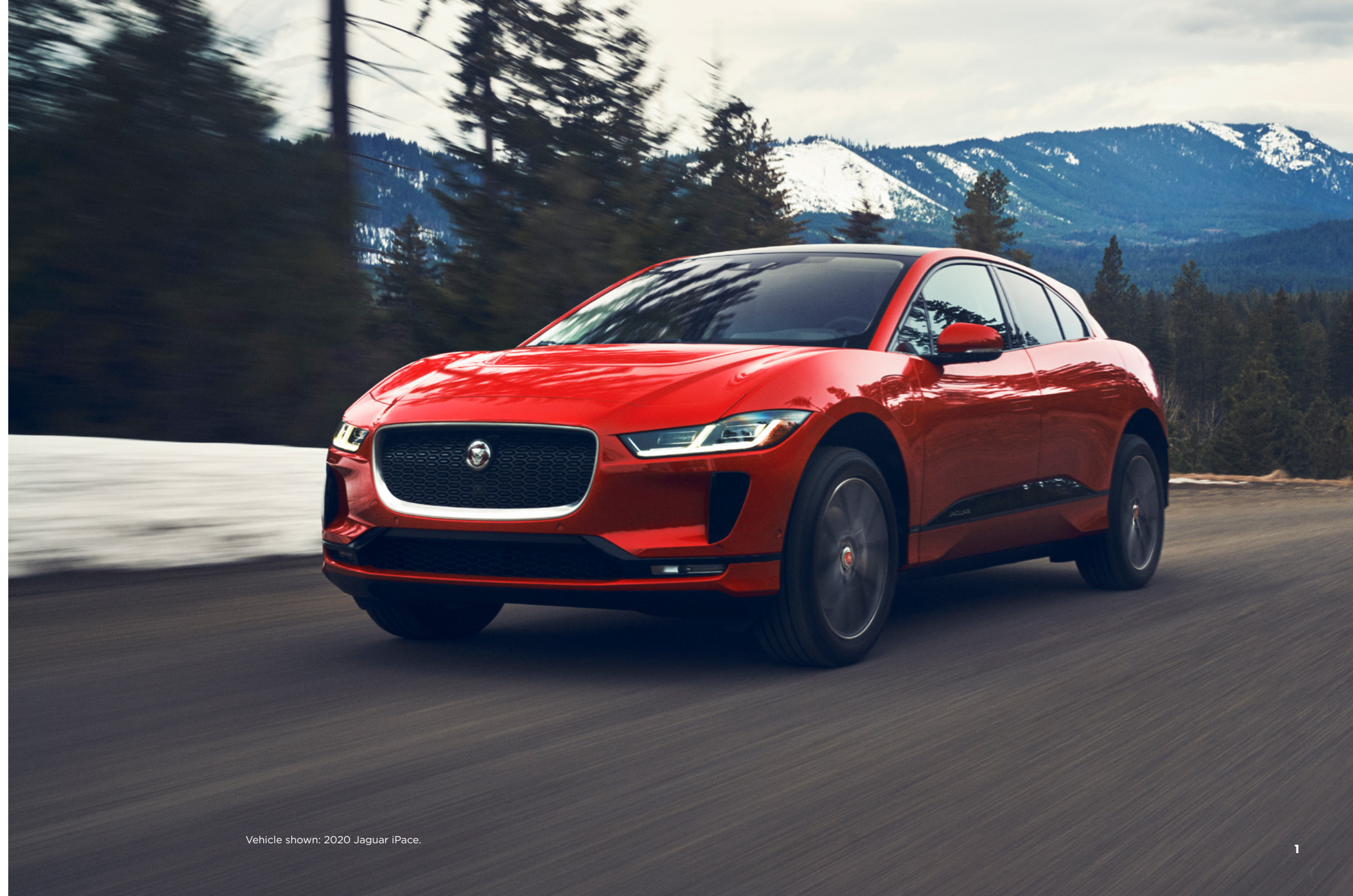
Vehicle shown: 2020 Jaguar iPace.