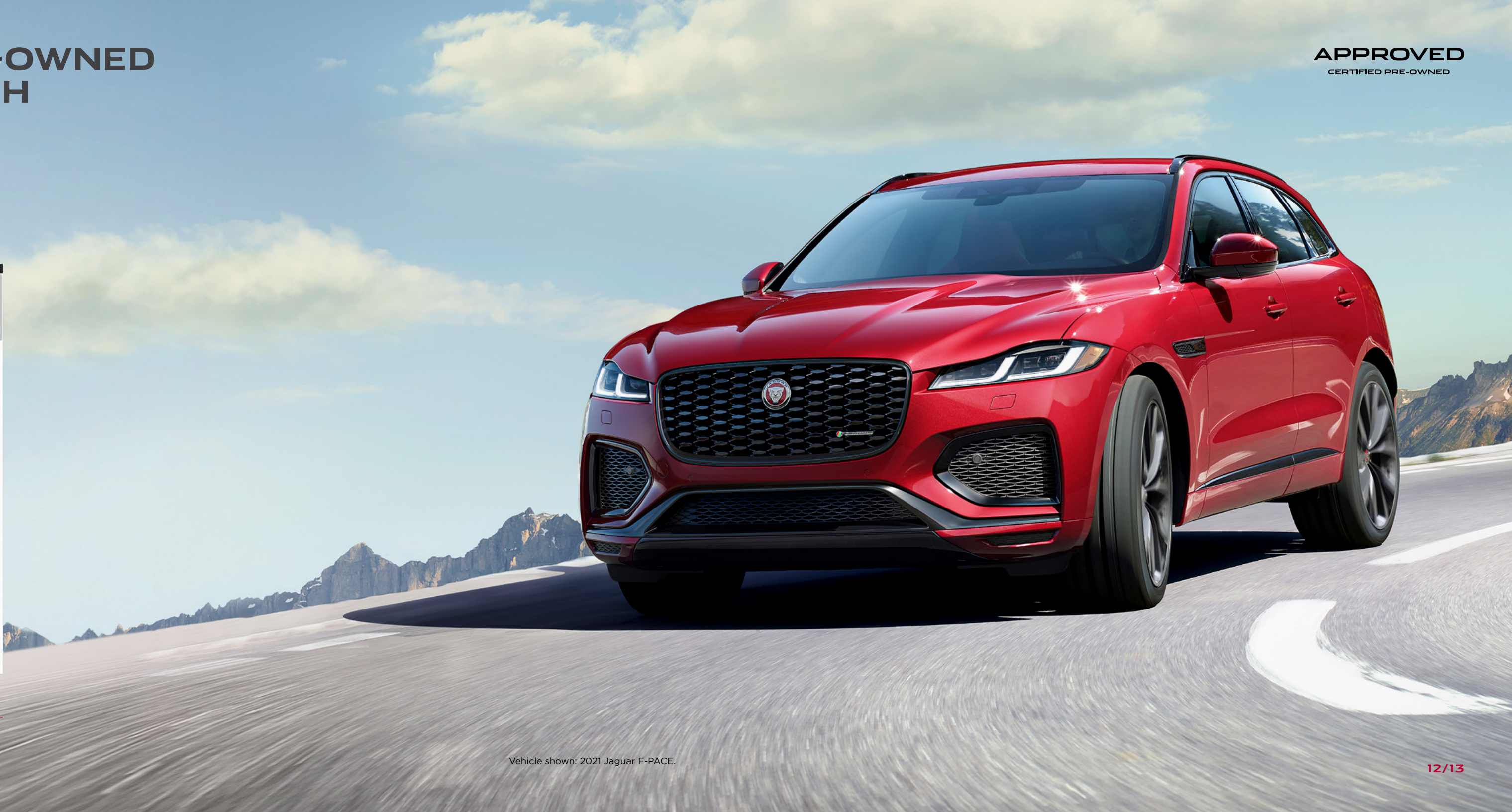
Vehicle shown: 2021 Jaguar F-PACE.