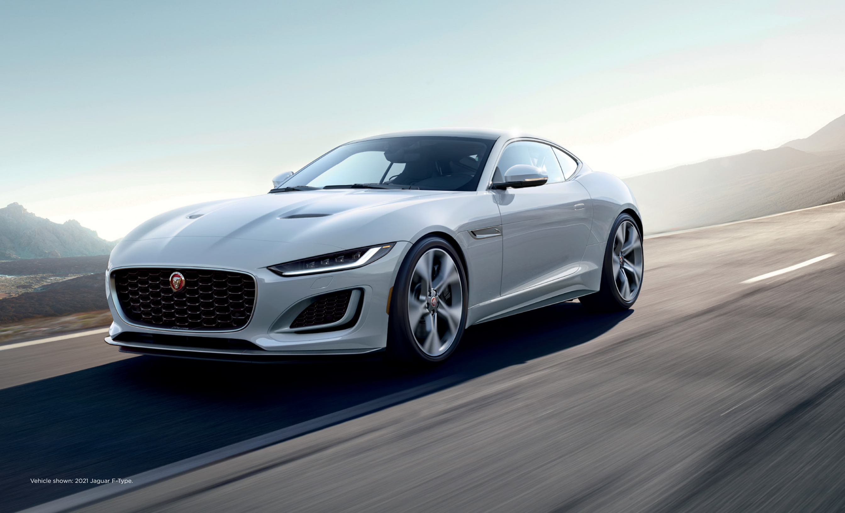
Vehicle shown: 2021 Jaguar F-Type.