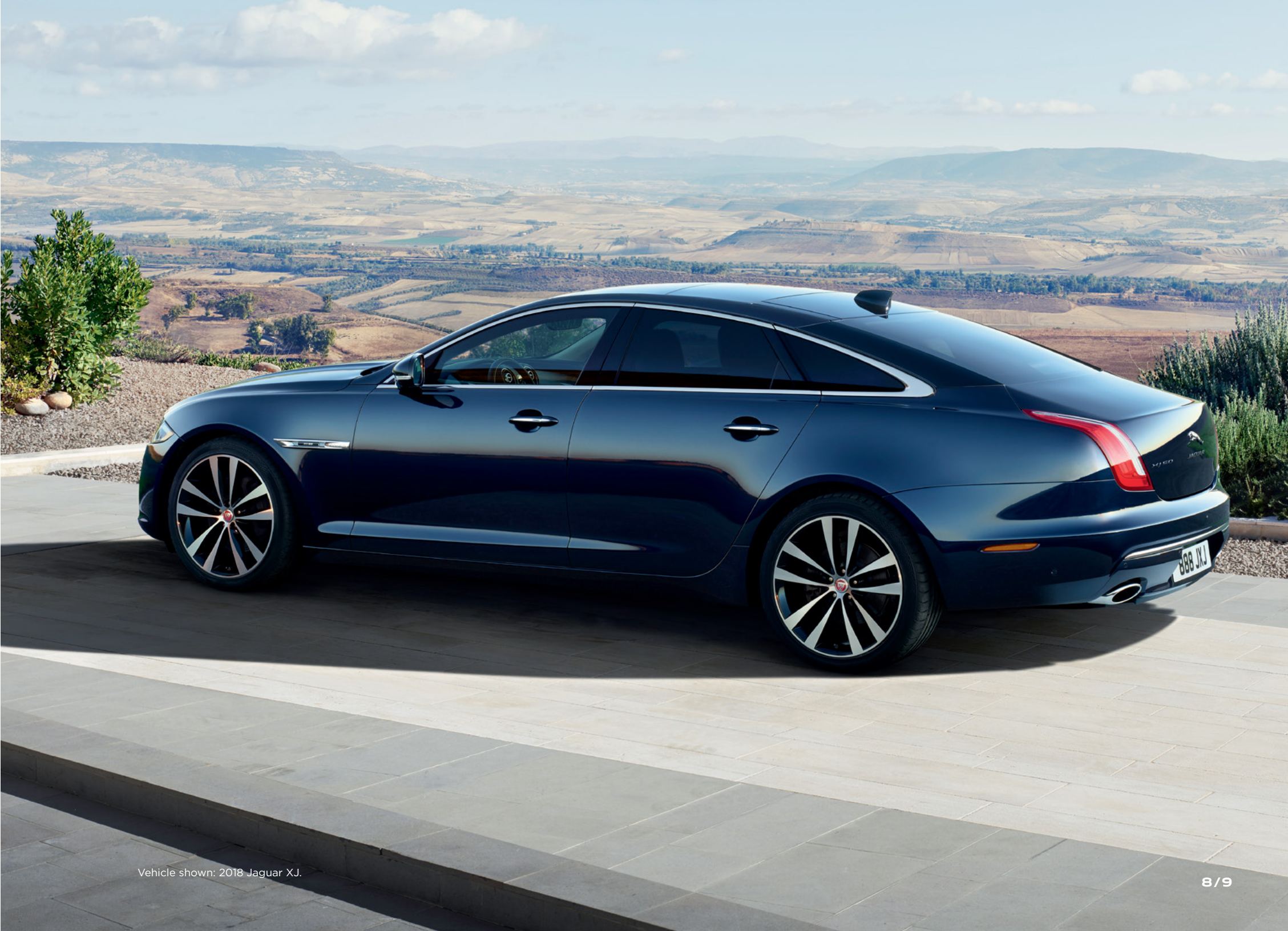
Vehicle shown: 2018 Jaguar XJ.

*See your local authorized Jaguar Retailer for complete details.