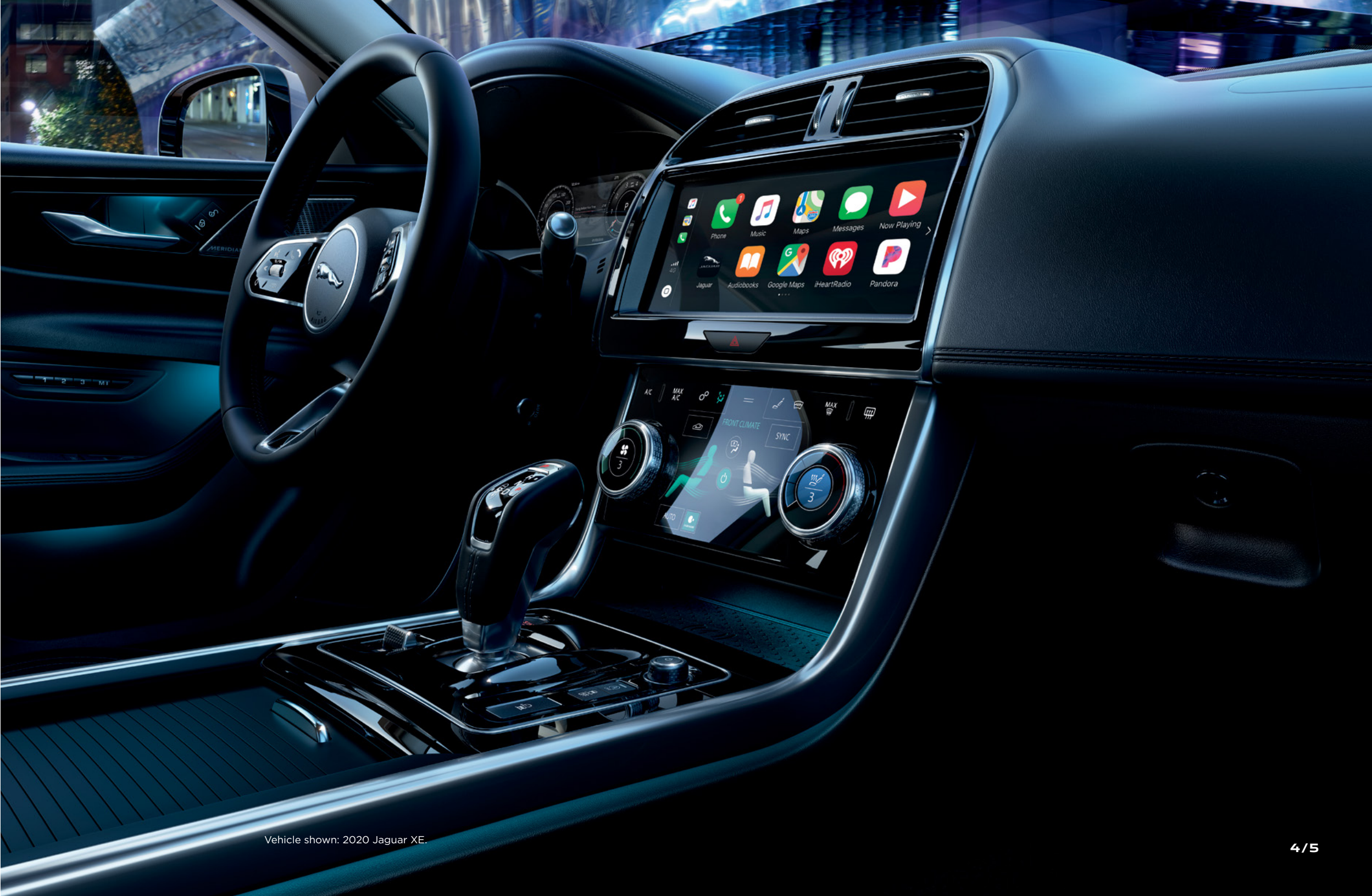
Vehicle shown: 2020 Jaguar XE.