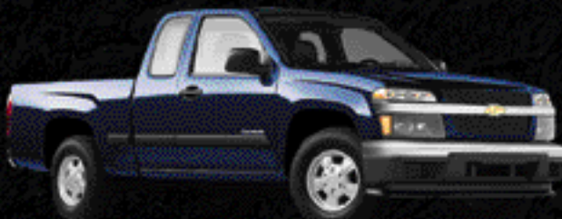
Indigo Blue Metallic