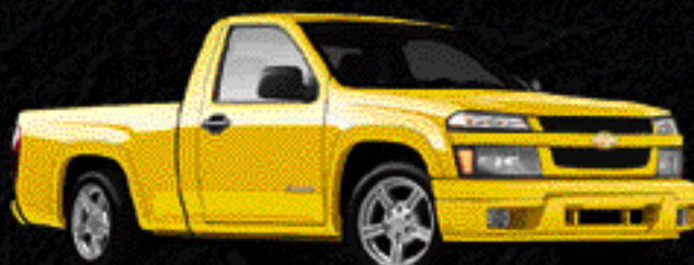
Yellow (extra-cost option)