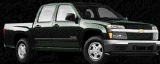
Dark Green Metallic