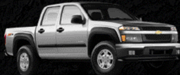
Silver Birch Metallic