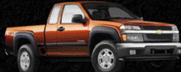
Sunburst Orange Metallic