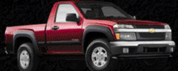
Cherry Red Metallic