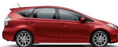
BARCELONA RED METALLIC