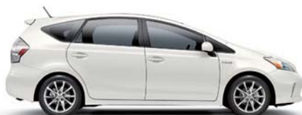
BLIZZARD PEARL (extra-cost color)