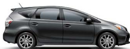
MAGNETIC GRAY METALLIC