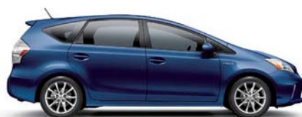
BLUE RIBBON METALLIC