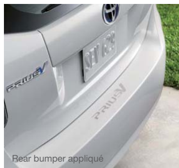
Rear bumper appliqué