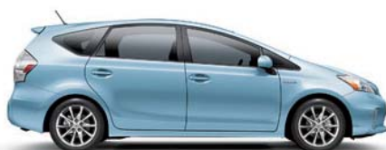
CLEAR SKY METALLIC