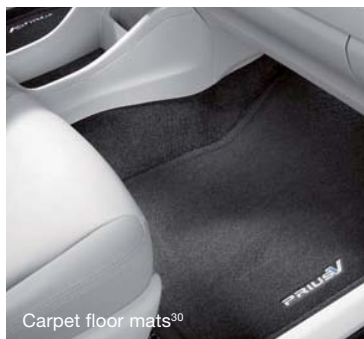
Carpet floor mats 30

Alloy wheel locks All-weather floor mats 30 Ashtray cup Cargo net Cargo tote Carpet floor mats 30 Emergency assistance kit First aid kit Folding carpeted cargo mat Hybrid Synergy Drive® window sticker Mudguards Paint protection film Rear bumper appliqué Remote Engine Starter VIP Security — Glass Breakage Sensor (GBS) 31