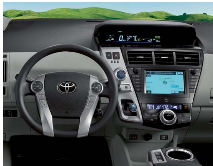
Prius v Five interior shown in Misty Gray SofTex with available Advanced Technology Package.

No, your eyes do not deceive you: That's the iconic and highly aerodynamic shape of the Toyota Prius, only bigger. It's the 2012 Prius v, a new addition to the Prius Family offering all the proven benefits of Prius, plus lots of added cargo volume. With the highest combined fuel efficiency of any SUV, crossover utility vehicle or wagon, 1 a Super Ultra Low Emission Vehicle (SULEV) rating 2 and loads of versatile features everywhere, it looks like the future is shaping up nicely. 2012 Toyota Prius v. Moving Forward.