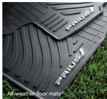
All-weather floor mats 30