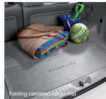
Folding carpeted cargo mat