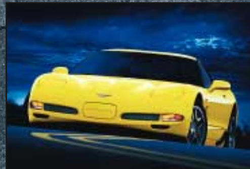
Corvette Z06® shown in Millennium Yellow (an extra-cost color).