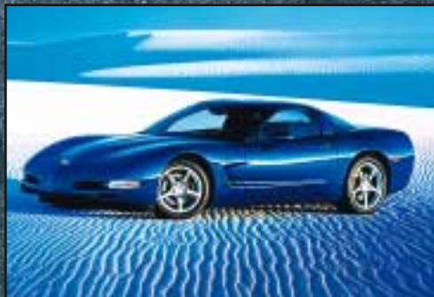
Corvette coupe shown in Electron Blue Metallic with optional high-polish aluminum wheels.