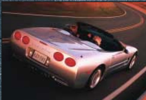
Corvette convertible shown in Quicksilver Metallic with optional equipment.