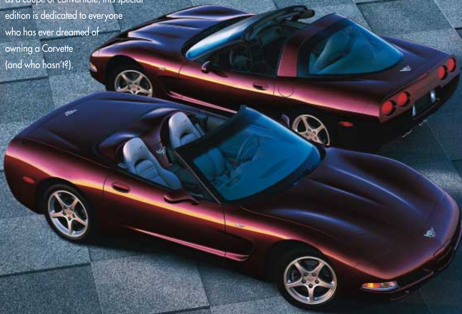
Corvette 50th Anniversary Edition (convertible and coupe) both shown in 50th Anniversary Red.

The legendary Chevrolet® Corvette® celebrates its golden anniversary this year with an exclusive 50th Anniversary Edition (limited availability). Offered as a coupe or convertible, this special edition is dedicated to everyone who has ever dreamed of owning a Corvette (and who hasn't?).